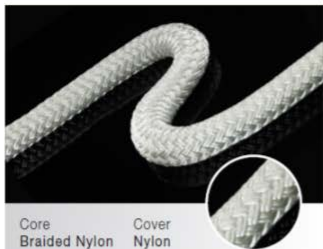
Core Braided Nylon Cover Nylon